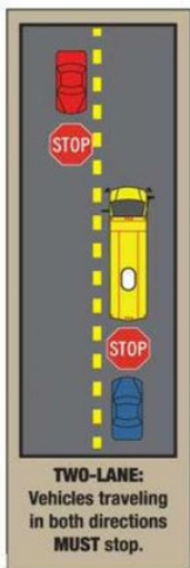
TWO-LANE: Vehicles traveling in both directions MUST stop.