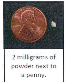
2 milligrams of powder next to a penny.

Carfentanil is a synthetic opioid approximately 10,000 times more potent than morphine and 100 times more potent than fentanyl. The presence of carfentanil in illicit U.S. drug markets is cause for concern, as the relative strength of this drug could lead to an increase in overdoses and overdose-related deaths, even among opioid-tolerant users.