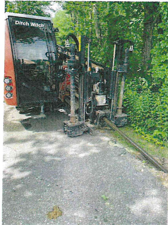
Figure 2: Directional Drill Equipment on East Road