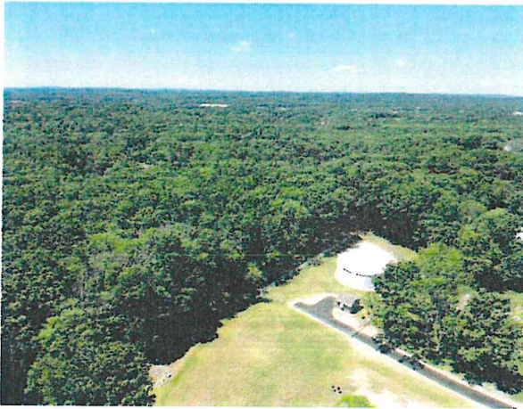
Figure 3: Drone Photo of the Tank Site

The Sweet Hill site was paved the first week of June and final site restoration was completed. The contractor, Lewis Builders has been working on completing minor electrical punch-list items.