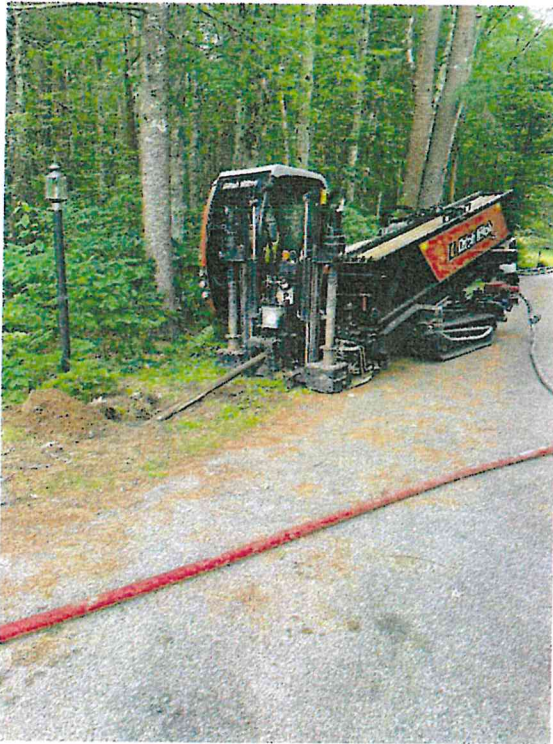
Figure 1: Directional Drilling Services on East Road

In June, the contractor, DeFelice installed approximately 3,000 LF of watermain and all services on East Road in Plaistow. All watermain and hydrants within the Plaistow Town Limits have been installed. The only watermain installation that remains is the approximately 1,200 LF connection from the Pump Station site to Atkinson. A few services remain to be installed on other roads. After the remaining watermain is installed, the only project items left will be paving and restoration.