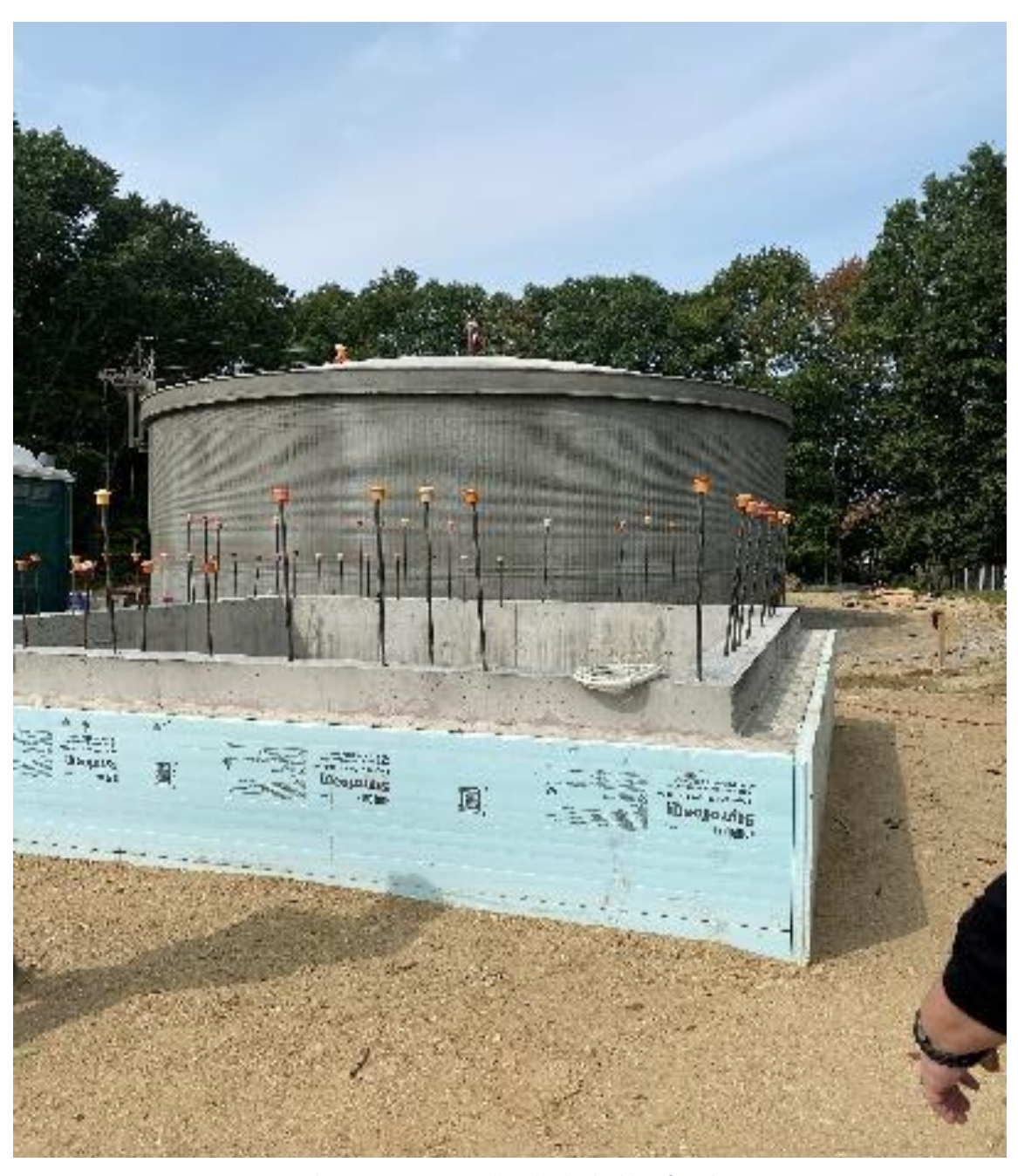
Figure 4: The water storage tank and valve building foundation.