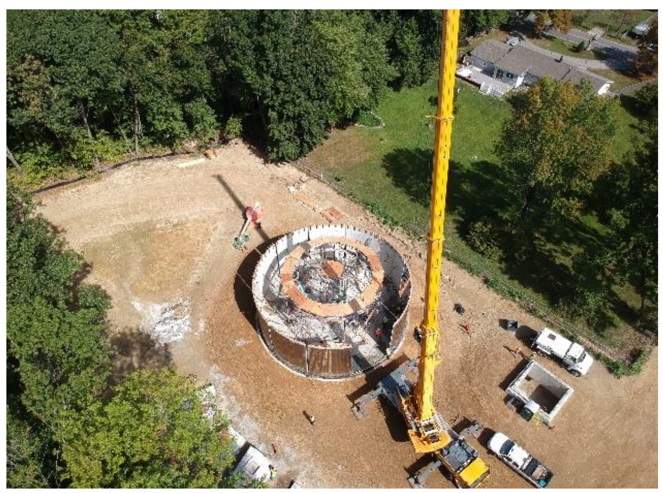
Figure 3: Drone photograph of tank construction.

Contract P3 began construction in June by HAWSCO and their subcontractor DN Tanks. The site has been cleared and graded. Initial construction of the tank has been on schedule and is expected to be complete on October 4<sup>th</sup>. The foundation of the valve building has been poured and the contractor is working on mechanical fit ups. Construction will continue on the valve building and remaining site work over the next few months. Masonry of the valve building is expected to begin October 5<sup>th</sup>.