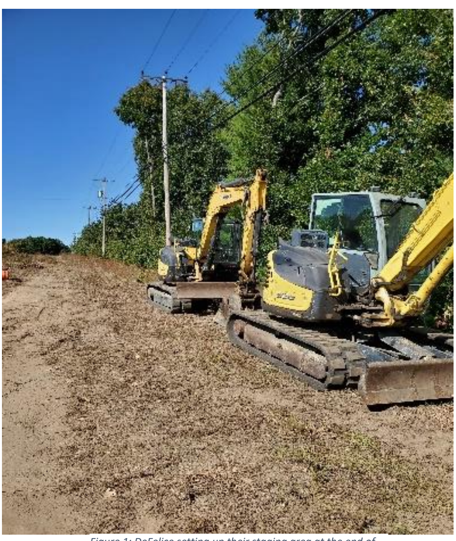
Figure 1: DeFelice setting up their staging area at the end of Hale Spring Road near the intersection with Kingston Road.

The contractor has set up their staging area and is mobilizing and beginning to install pipe on Hale Spring Road. The contractor will install and test pipe on Hale Spring Road and continue working up Sweet Hill Road to the water storage tank. DeFelice plans to work on the watermain on Wentworth Ave and Westville Road later this fall.