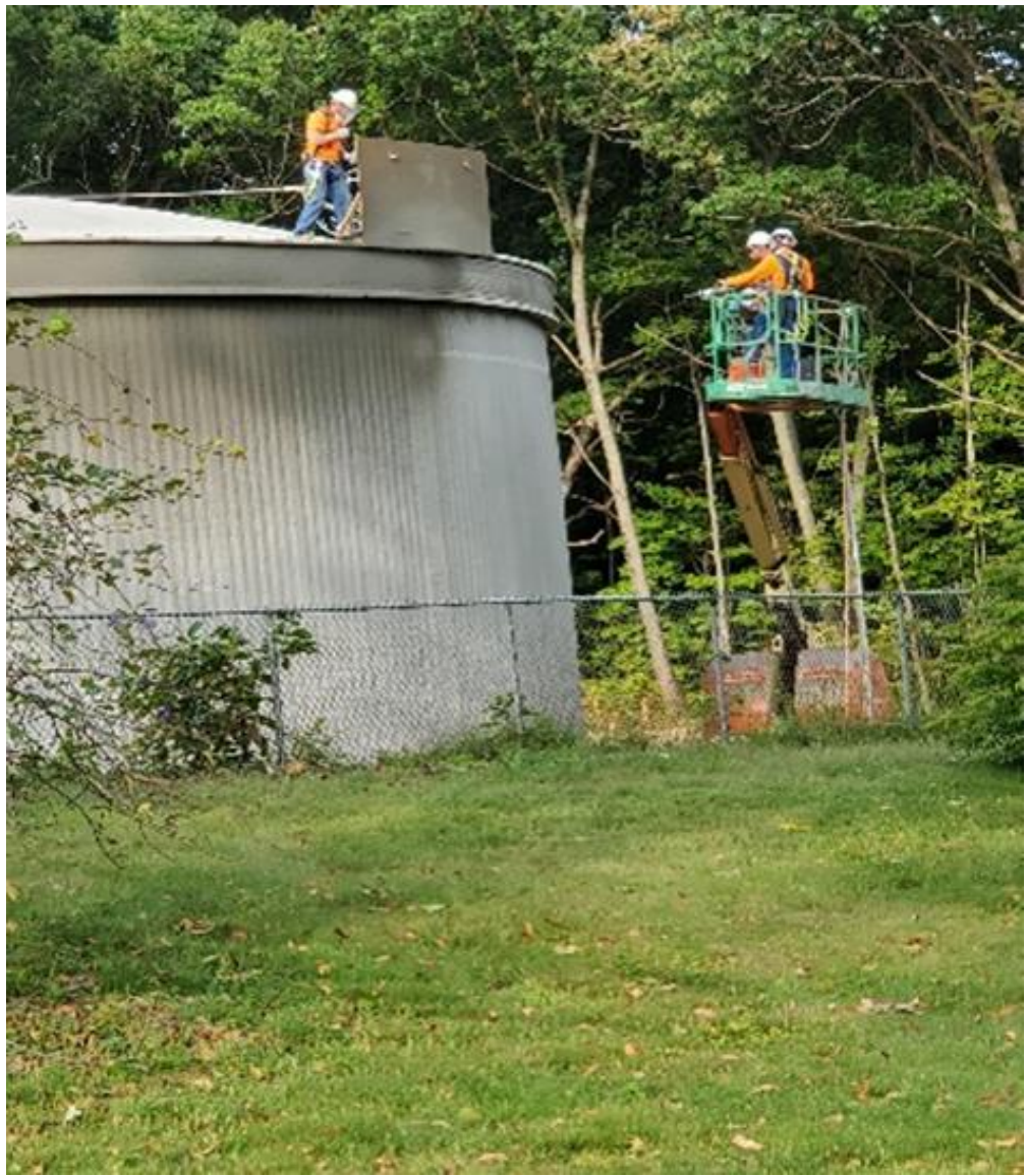
Figure 5: Contractors spraying shotcrete on the tank.